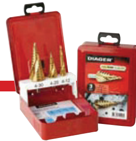
HSS step drill box 4>12 / 4>20 / 4>30 503C 3336600144095